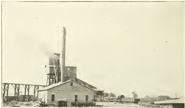
Fairmount Coal Co.—Fairmount.

At No. 3 mine, after it had been destroyed by fire and abandoned for five years, the outside equipment at the plant, including office building, boiler house, engine house, shop, tippel, main track, etc., have been rebuilt. The underground air courses and haulage roads have been thoroughly cleaned; new haulage tracks have been laid and fire proof shaft bottoms and the underground stable are now in course of construction.