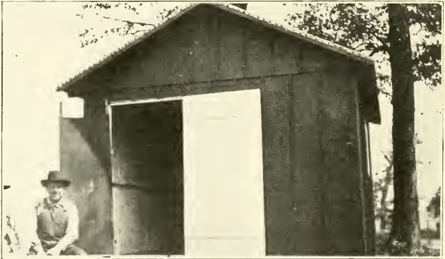
First Aid Hospital—Bunsen Coal Co.

This company has established an emergency hospital at each of their mines, and equipped them with a first aid equipment, and are also instructing certain employés in the work of first aid to the injured.